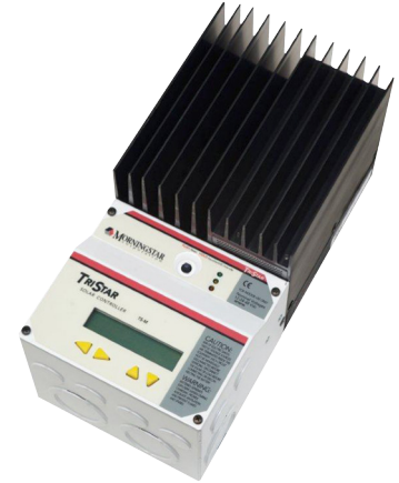
30, 45 or 60 amps at up to 150 volts open circuit. Shown with optional meter.

The TriStar MPPT features a smart tracking algorithm that maximizes the energy harvest from the PV by rapidly finding the solar array peak power point with extremely fast sweeping of the entire I-V curve. This product is the first PV controller to include on-board Ethernet for a fully web-enabled interface and includes up to 200 days of data logging.