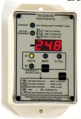
TM-2030 Battery Monitor

Battery charge information, battery charging rate control