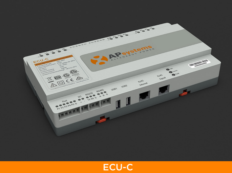
The ECU-C, designed from the ground up as a multi-featured gateway for commercial applications, offers advanced functionality for more data-centric installations, with consumption and production monitoring, contact and relay ports, and high-frequency metering.