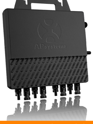
QS1: Quad-module (4:1)