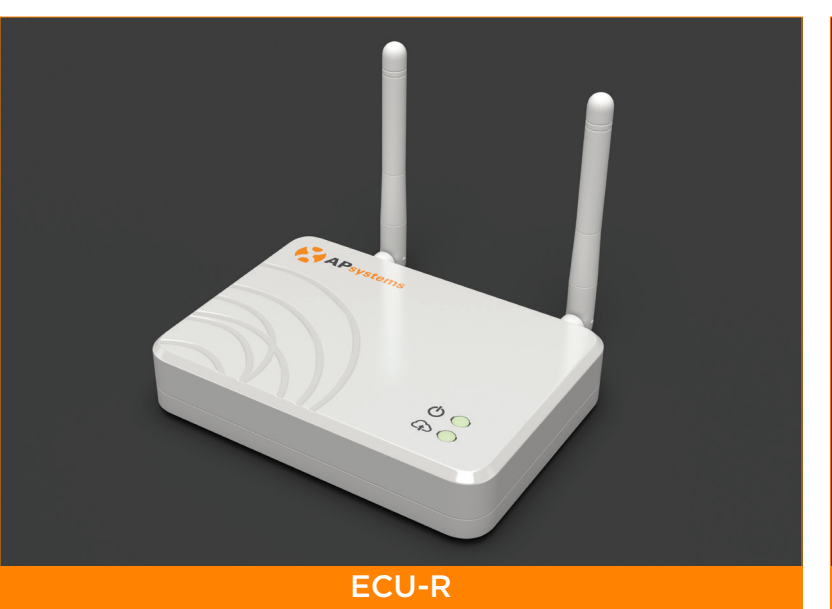
The ECU-R is the information gateway designed for residential applications. It collects and transfers module performance data giving you comprehensive monitoring and control over each individual module, optimizing the performance of your solar array.