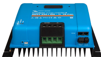
SmartSolar Charge Controller MPPT 250/100-Tr VE.Can without display