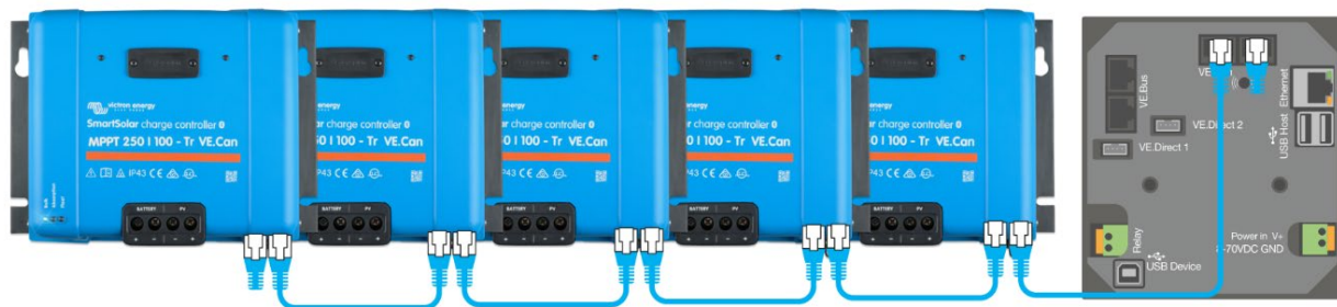
With VE.Can up to 25 Charge Controllers can be daisy-chained and connected to a Color Control GX or other GX device Each Controller can be monitored individually, for example on a Color Control GX and on the VRM website