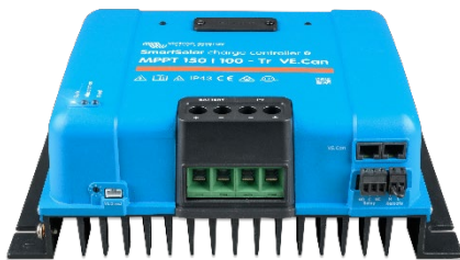
SmartSolar Charge Controller MPPT 150/100-Tr VE.Can without display